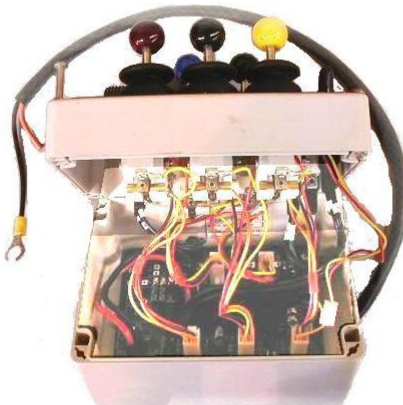
Switch using contact breaker points